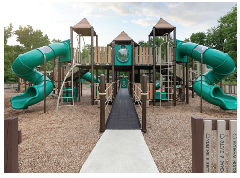
IPEMA certified impact rating for 12' Cost effective Non-toxic virgin wood Low maintenance Natural looking Made from 100% fresh-grade wood ADA accessible